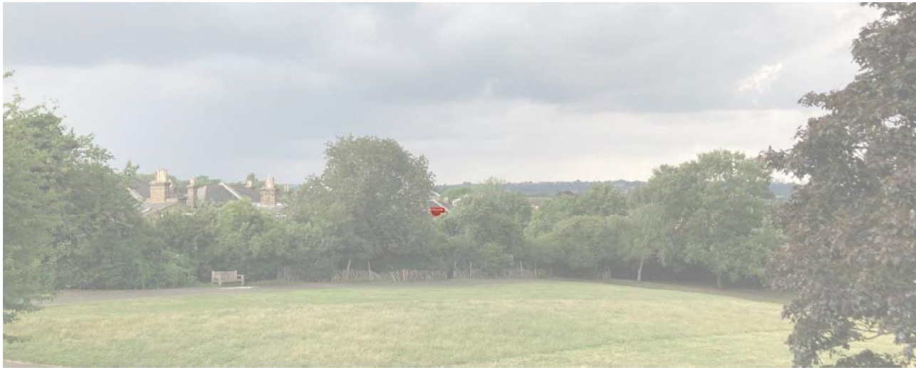
Figure 4: View of rear of property from Telegraph Hill Upper Park