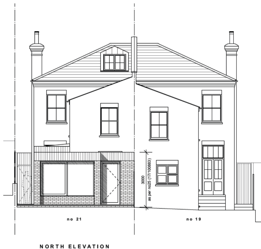
Figure 2: Proposed rear elevation