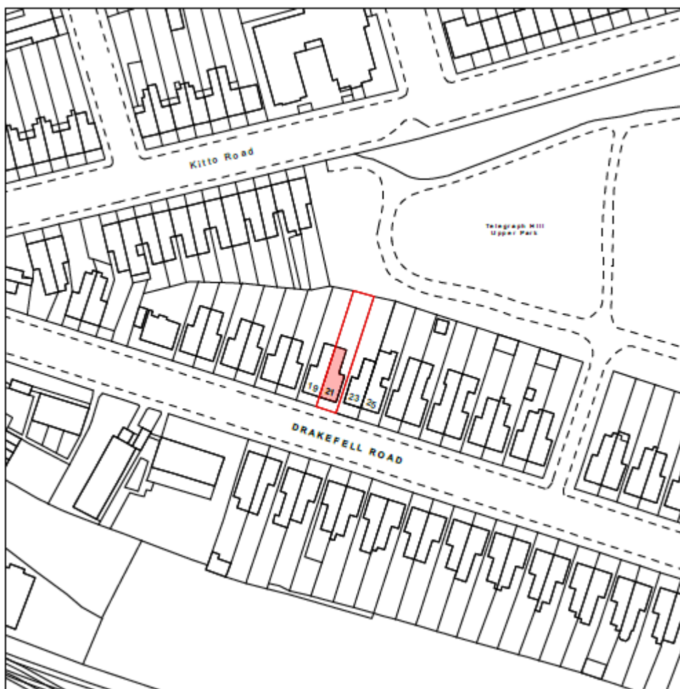
Figure 1: Site location plan