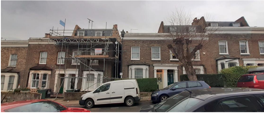
Figure 3. Front Elevation photograph of 204-214 Albyn Road (right to left)