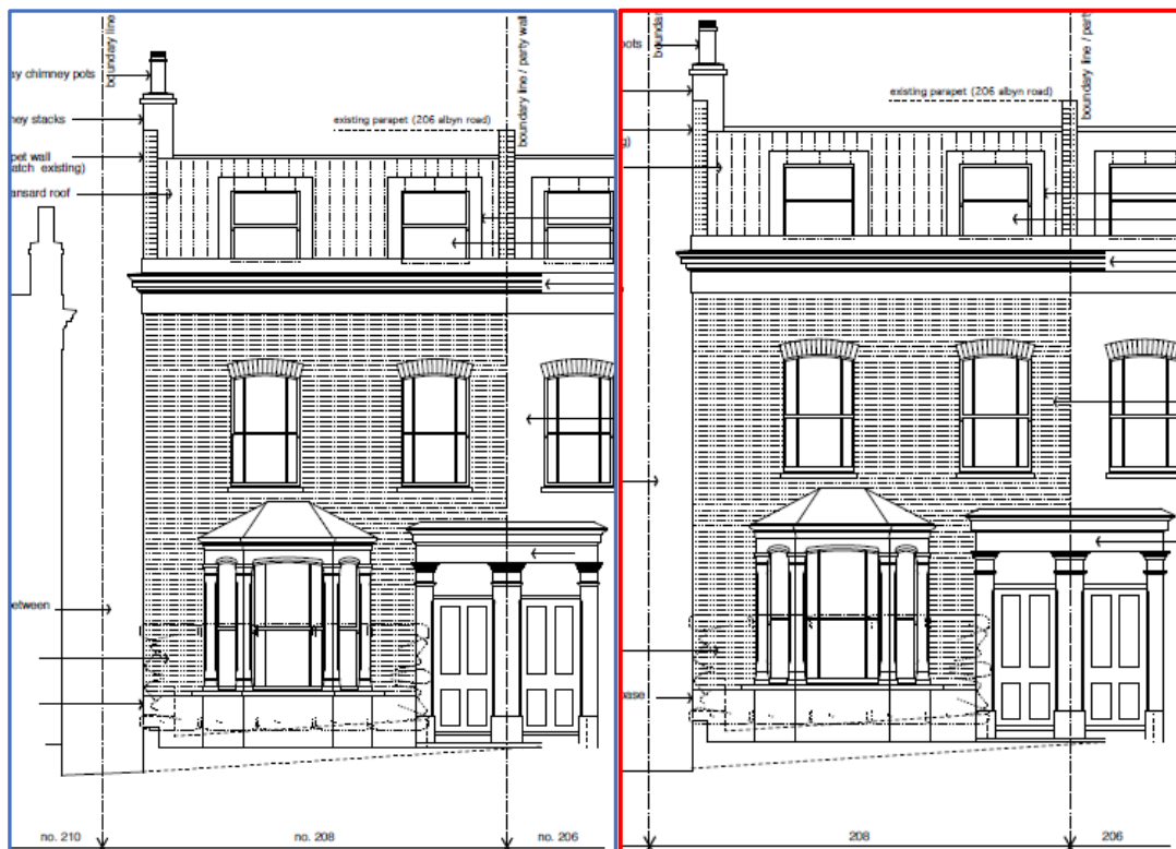
Figure 2. Comparison between the proposed front elevations of the approved 2013 scheme (outlined in blue) and the application scheme (outlined in red).

10 The proposed mansard would be similar to the extension granted permission in 2013. Figure 2 below shows a comparison of the proposed front elevations for both applications.