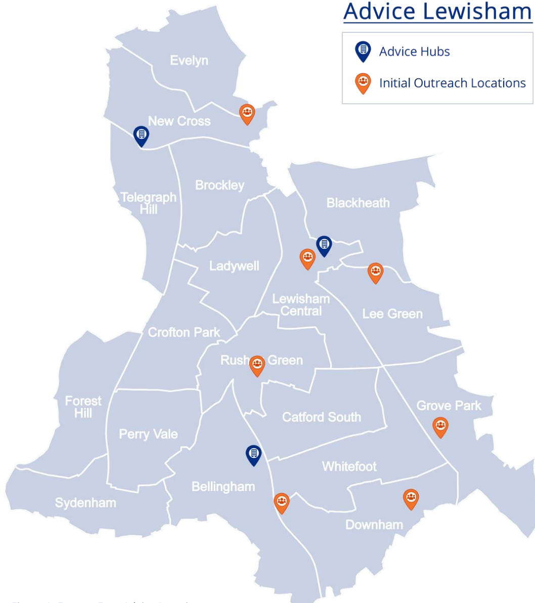
Figure 1: Face-to-Face Advice Locations