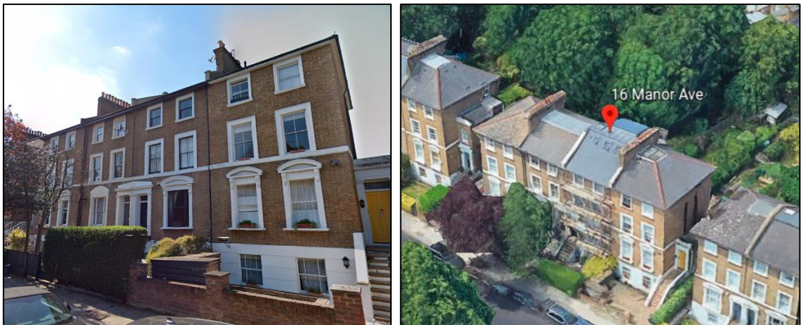
Photo 2. Front roof slope of No.17 Manor Avenue

It is noted that the ridge of No.17 Manor Avenue located on the opposite side of the road has been raised by a similar amount. However, the angle of the pitch of the roof was not increased as a result of these works, as shown in Photo 2 below. It is the combination of the raised ridge and change to the pitch of the roof that creates the obvious contrast with the adjoining properties and unbalances the roofscape.