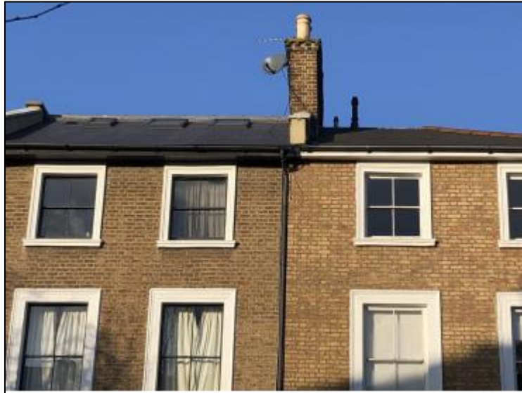
Photo 1. Front roof slope of No.16 Manor Avenue

The property is situated within the centre of the short terrace, which generally have consistent rooflines. As such, the raising of the ridge and associated alteration to the pitch of the front roof slope results in the roof of the property conspicuously projecting above those of the adjacent properties on either side. This is clearly perceptible from public viewpoints and unbalances the roofscape within short and longer views, resulting in a detrimental visual impact to the historic roof form of the host property and the cohesive nature of the immediate terrace, as is shown in Photograph 1 below.