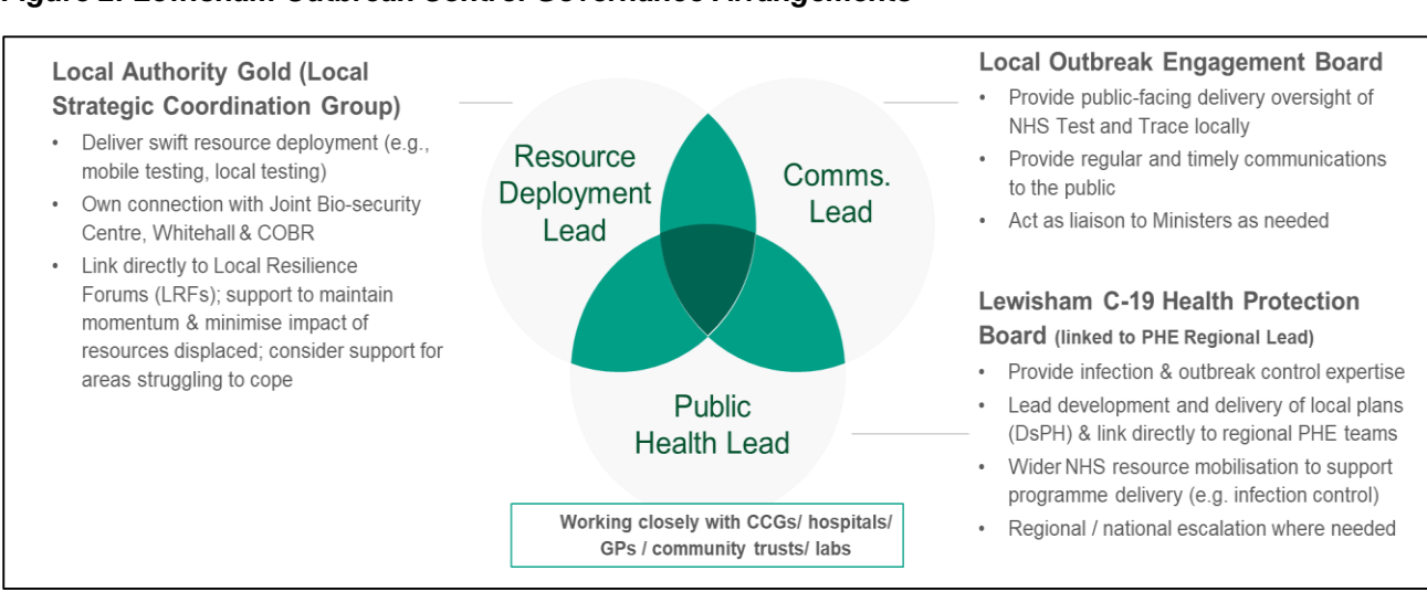
Figure 2: Lewisham Outbreak Control Governance Arrangements

Building on the robust governance structures used for the COVID-19 pandemic response in Lewisham, the three main governance levels for development implementation and oversight of the plan will be as outlined in Figure 2 and Table 3 below. Escalation and decision making around the management of an outbreak will be outlined in 'Data Integration' and 'Outbreak Management' sections below.