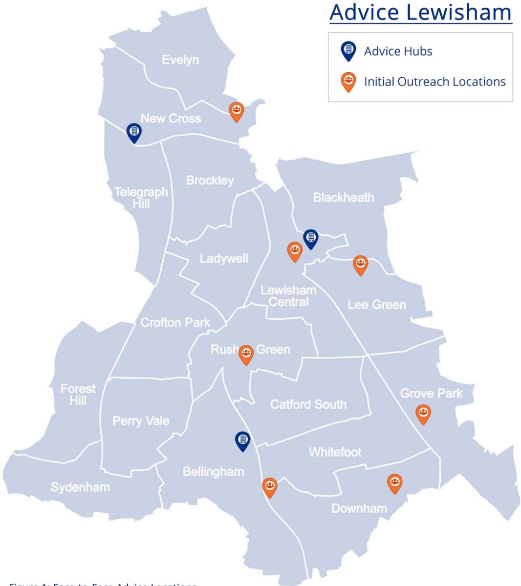
Figure 1: Face-to-Face Advice Locations