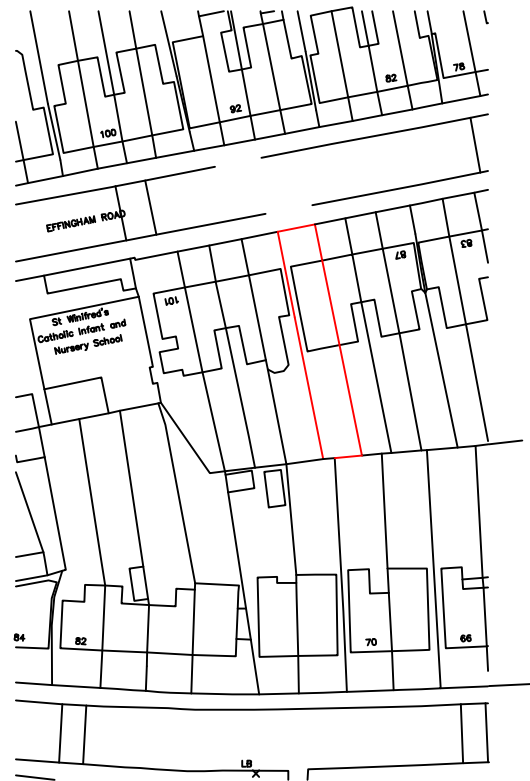
Block plan Scale 1:1250