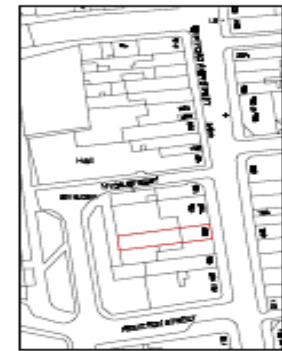
Location Plan (1:1250)