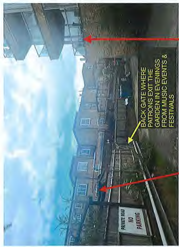
STAGE IN BLACKHEATH CREATIVES GARDEN