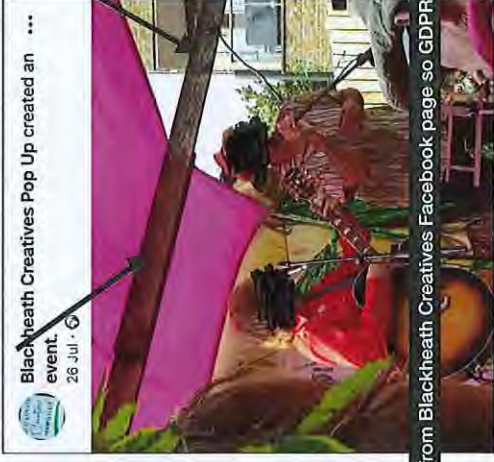
image from Blackheath Creatives Facebook page so GDPR compliant