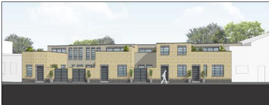
Figure 3 - Previously refused development (DC/21/121776)

29 These alterations are a direct consequence of the appeal decision (ref. APP/C5690/W/21/3287376) which highlighted three aspects of the previous scheme (loss of employment, impact on the conservation area and cycle provision) which resulted in the dismissal of that appeal scheme.