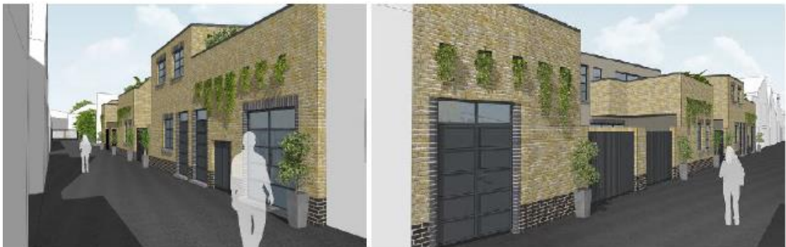
Figure 2 – proposed development