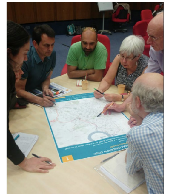
Image 1 Consultation for the Lewisham Characterisation Study