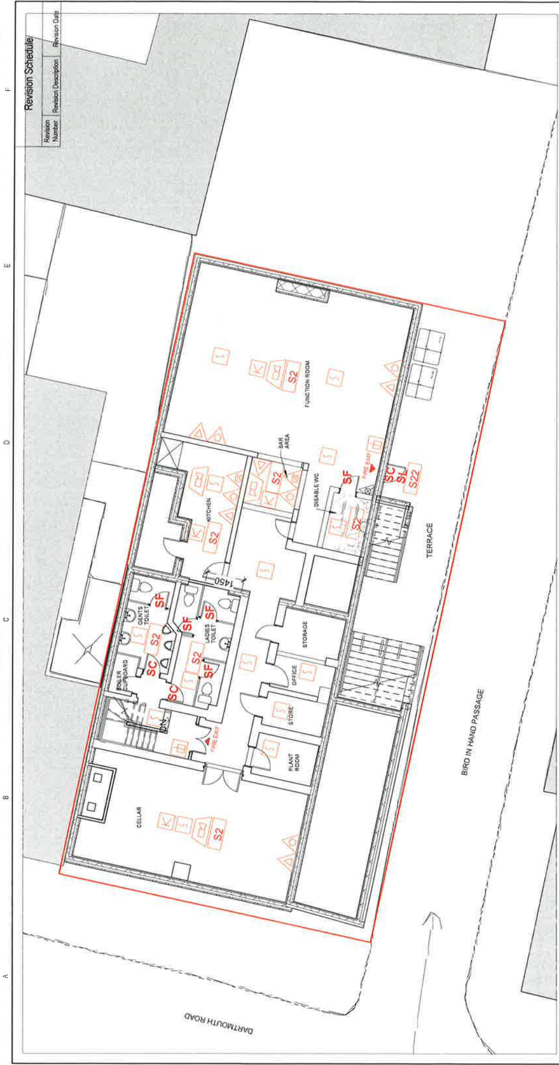
1 Proposed Lower Ground Floor plan - LICENSING scale: 1 : 100