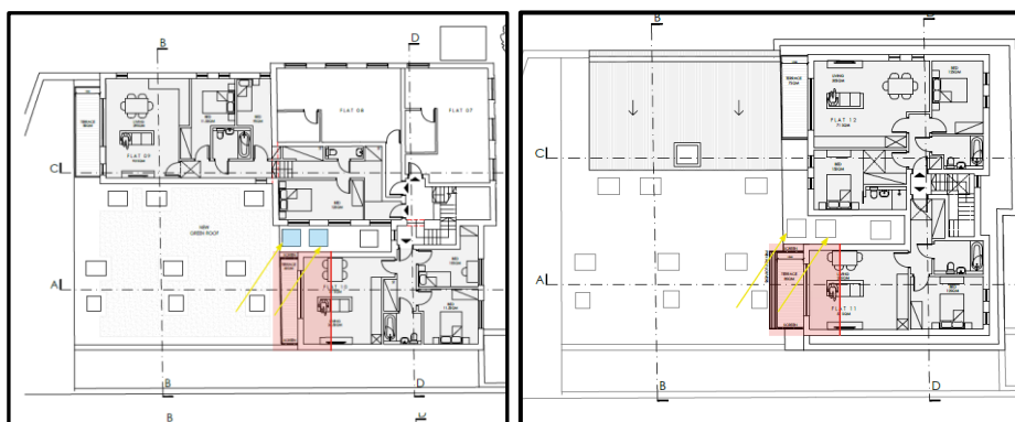
Figure 2. Drawing showing change to the depth of the extension and relationship to the rooflights serving Flat 2 with the massing removed highlighted in red.