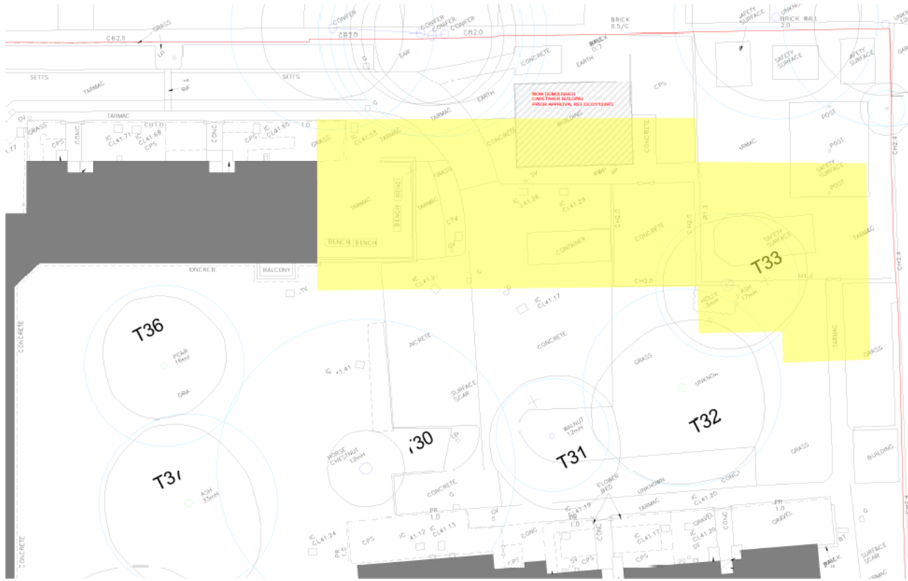
1 Block A - Existing Site Plan 1:100