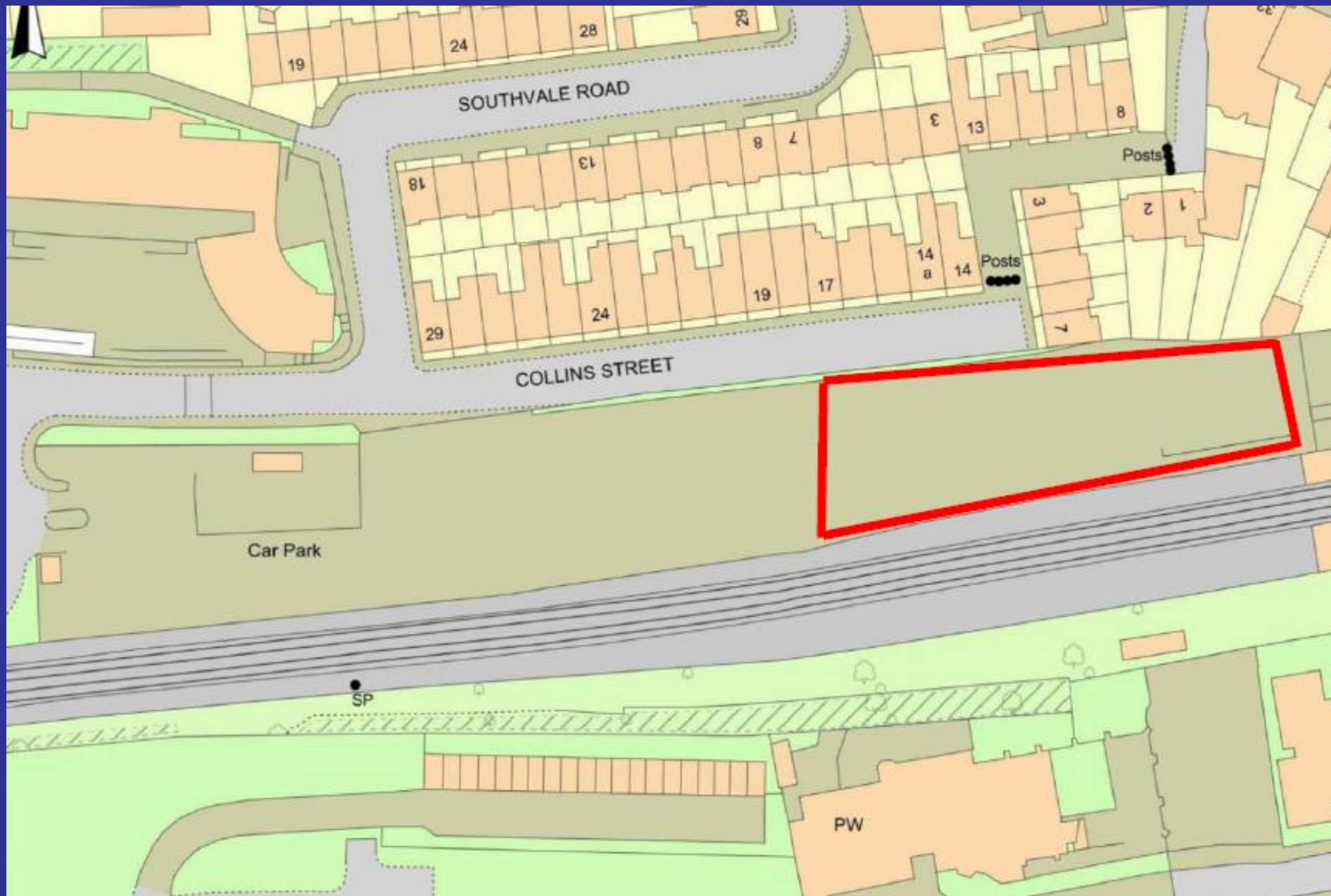
Front Elevation Photograph