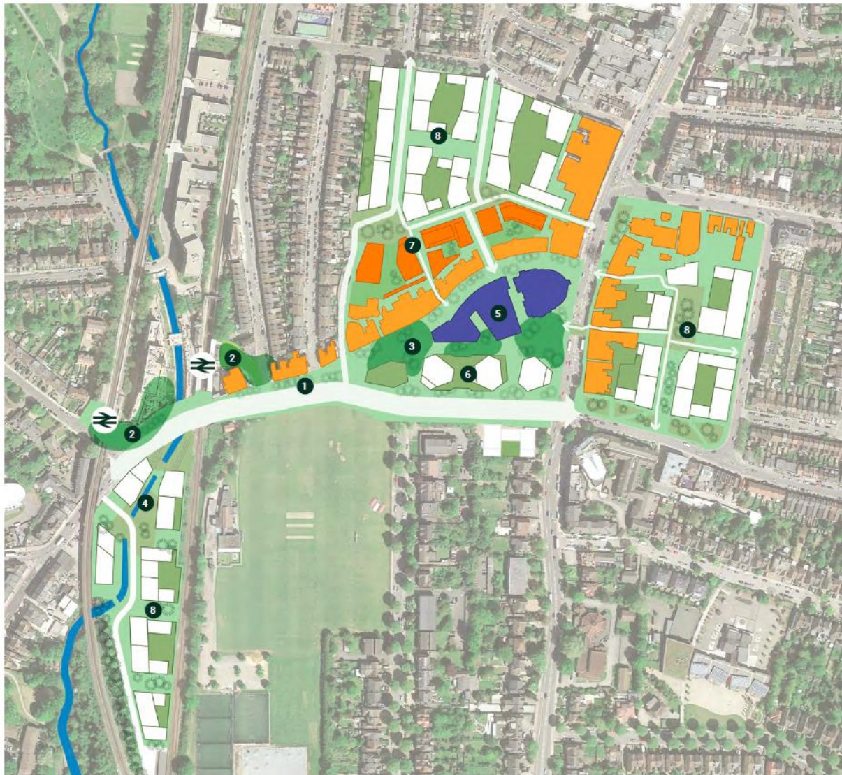
The Catford key placemaking principles in summary

4 Creating a more natural setting for the River Ravensbourne including unveiling the culverted river