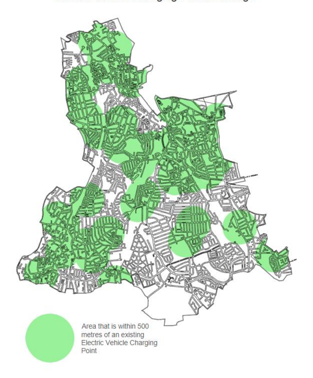
Figure 1- Coverage of Electric Vehicle Charging Points in Lewisham

Electric Vehicle Charging Point Coverage