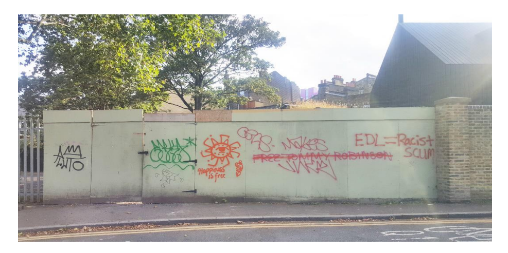
Figure 2 photo of front of site

The site is 136sqm in area and is an irregular shape. To the west, the plot shares an 8.9m long boundary wall with No 1 Crossfield Street. To the front is a wooden fence with a gate, which provides access to the site from Crossfield Street, which continues the brick wall frontage of No 1 Crossfield Street. It is not known when or why the brick wall fronting the site (identical to that on either side of the site) was removed. The boundary wall to the back is a brick wall with a height of 1.4m and a timber trellis fence on top (see photo below).