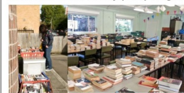
Sorting for the book sale in the week before and the buzz of activity on the day itself.