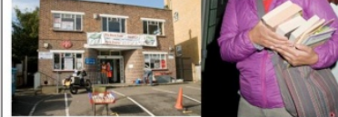
Tea and fancy cakes make the book sales a nice day out—and at one the SLH campaign had a tiny table to collect signatures to the current petition.