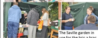
The Saville garden in use for the bric a brac and toy stall, and the police cadets who are regular helpers.