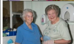
Volunteers in the kitchen.