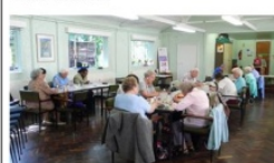
A traditional bingo session and the Saville Knitters have a giggle.